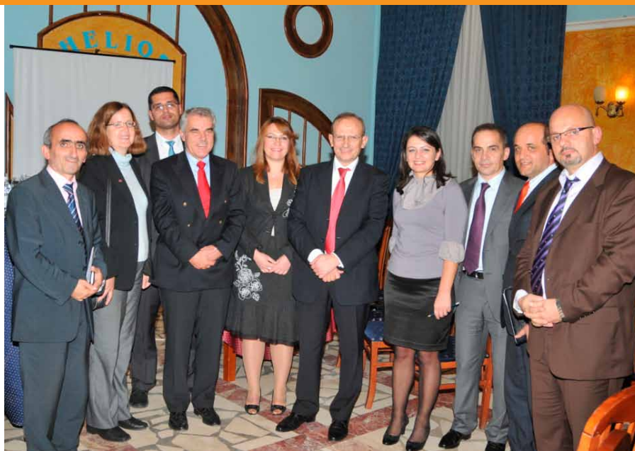
Photo: “Jour Fixe” on Vocational Education and Training and Information Communication Technology organised by the DACH-Plus on 27 October 2010

Further on, Minister Tafaj elaborated on the CBA Project goals for 2011 and the future of cooperation with the World Bank, viewed from the perspective of its strategies on education up to 2020. The Minister pointed out that the goals of our strategies for the development of education at all levels are entirely in line with the World Bank strategies on education till 2020. Further on, the Secretary General and representatives of the relevant directorates of the Ministry made a detailed overview of the progress achieved to date in the program and planning for 2011.