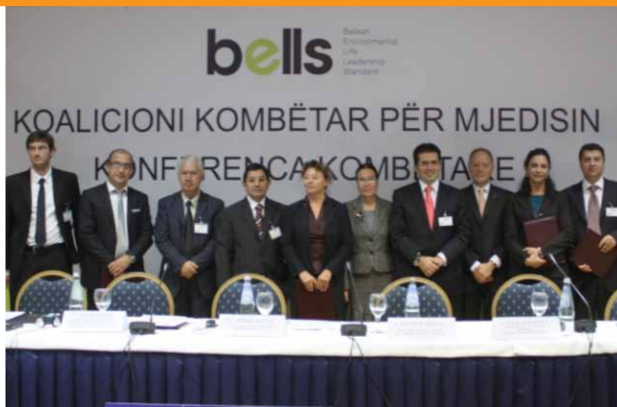
Photo: National Conference of the National Coalition for the Environment held on 26 October 2010

promote the use of Albania's new standardized address system was launched on 27 October 2010, in framework of the project "Modernisation of Administrative Address and Civil Registration Systems", funded with EUR 2.5 million by the EU, and additional funds by the OSCE and US government and implemented by OSCE.