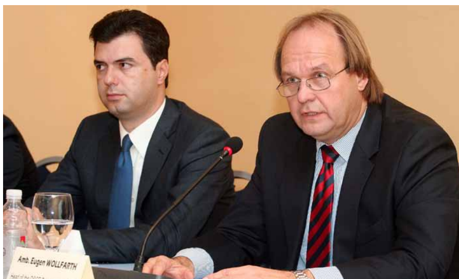
Photo: Minister of Interior, Lulzim Basha and Head of the OSCE Presence, Ambassador Eugen Wollfarth, launching the public awareness campaign promoting the use of Albania's new standardized address system, as part of an EU-funded project implemented by the OSCE Presence in Albania, October 2010 (Photo/LSA).

The long-term success of the new address system and related undertakings, such as the 2011 Census depend on government will on inter-institutional cooperation, and on the collaboration authorities, such as the General Directorate of the Civil Status, Civil Status Offices and Urban Planning Offices.