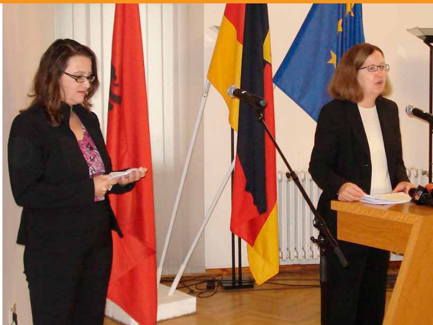
Photo: Presentation of the German-Albanian Development Cooperation during the German October