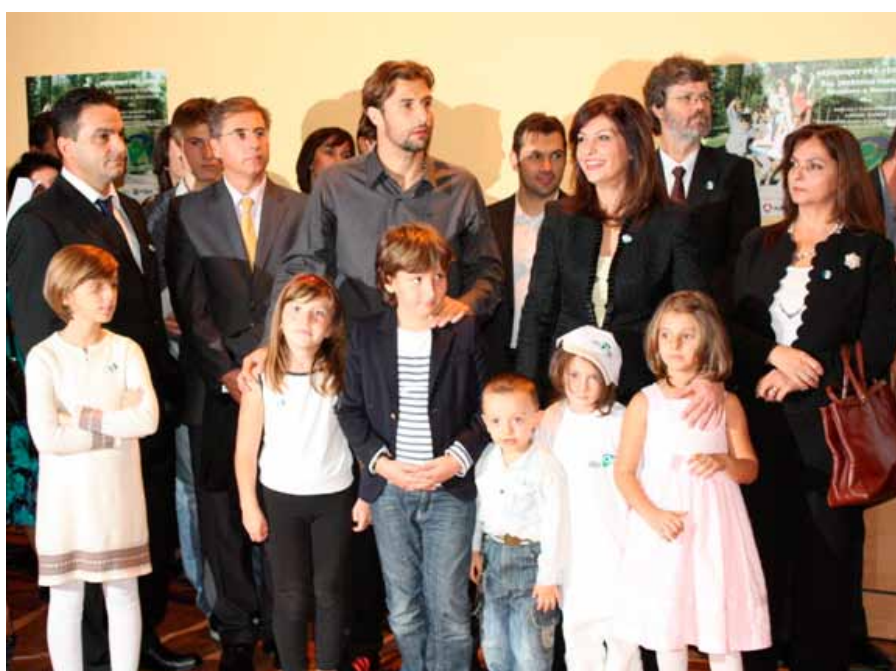
Photo: “ALO 116” Ambassadors Jozefina Topalli and Lorik Cana during the ceremony organised on 5 October 2010