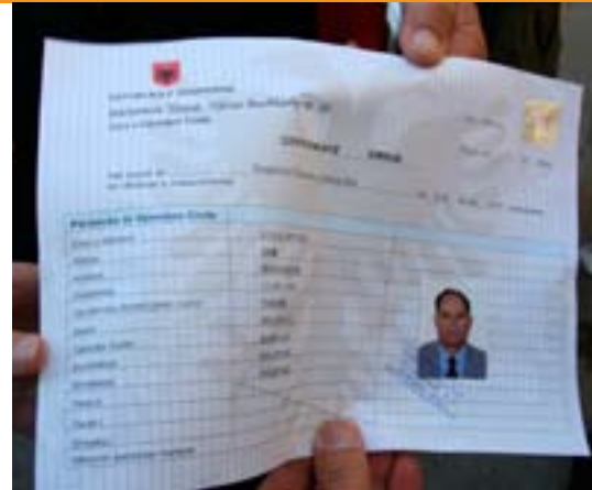
Caption: Printed civil status certificate, which was made possible due to the work of the Ministry of Interior, with support from the OSCE Presence and Statistics Norway.

Photo: The Ambassador of Spain in Albania and the General Coordinator of the Spanish Cooperation for the Balkans visit the area of Gerdec tragedy