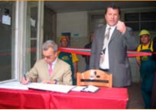
Photo: The Inauguration of the works of restructuring of the Korca Polyclinic - the Italian Ambassador, Saba D'Elia signing the Gold Book for personalities contributing to the Albanian development