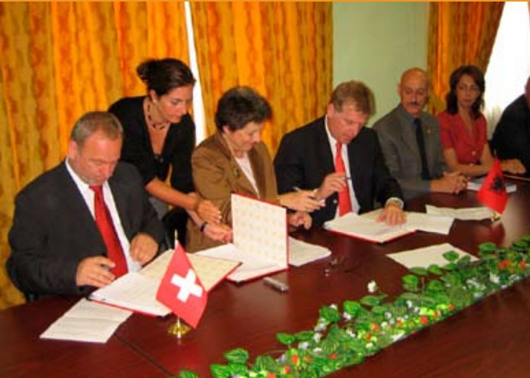
Photo: Swiss Ambassador Ms Yvana Enzler signed an agreement with Minister of Labour Social Affairs and Equal Opportunities, Mr. Koço Barka, and with the Minister of Education, Mr Genc Pollo on supporting the Albanian Vocational Education and Training (AlbVET) in Albania on 23 July 2008 (Photo: Swiss Cooperation Office).