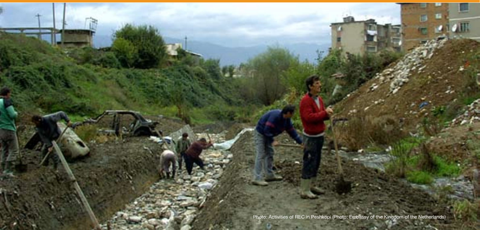
Photo: Activities of REC in Peshkopi

are focused on local environmental problems such as solid waste management, sewage water systems, energy efficiency, environmental risks in local communities, urban infrastructure. Two recent workshops focused on public participation on local level and the role of civil society in Environmental Impact Assessment (EIA) processes. For more information please click here .