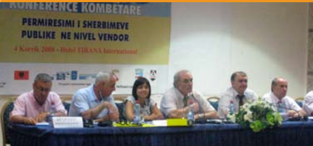
Photo: Representatives of the EC delegation to Albania and the beneficiaries at the National Conference, held on 4 July 2008, announcing the preliminary results of the project