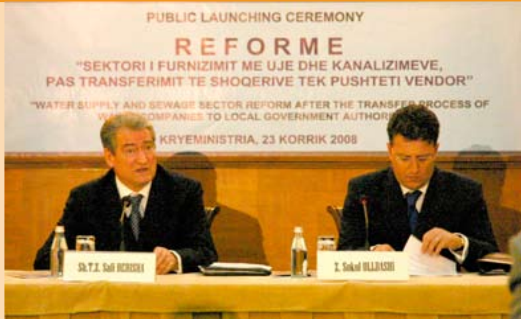
Photo: Prime Minister Berisha and Minister of Public Works, Transport and telecommunications, Sokol Olldashi at the Public Launch of the two-year plan of Water Supply and Sewerage Sector Reform