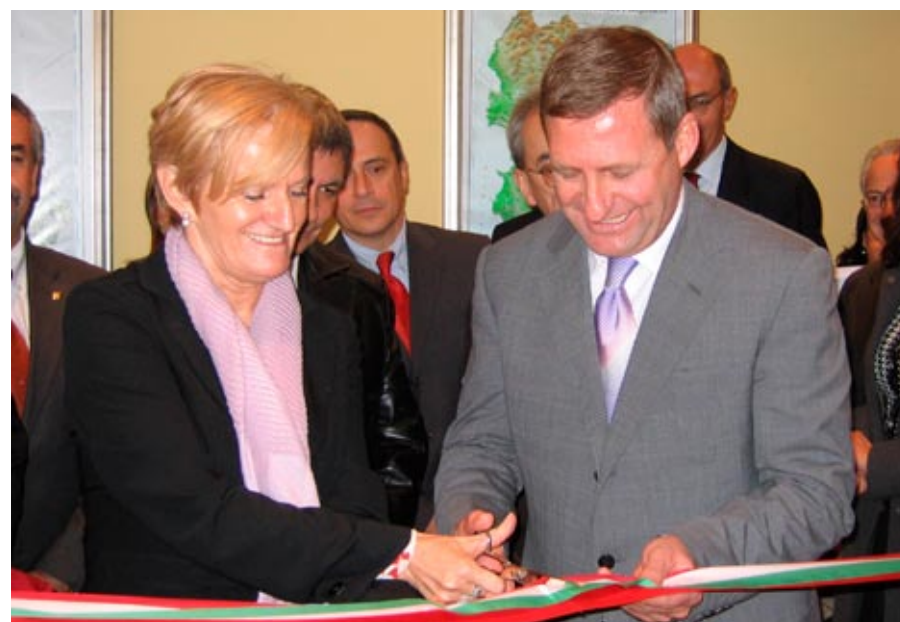
The Albanian Minister of Health, Mr. Ndoka, and the Italian homologue, Mrs. Turco, inaugurate the Unit for Studies and Technical Assistance to the Ministry of Health.

On 19 November 2008, the Italian Minister of Health, Mrs. Livia Turco, visited Albania to sign the Memorandum of Understanding with Albanian Minister of Health, Nard Ndoka. Both attended the inauguration of a Unit for Studies and Technical Assistance in the Ministry of Health, created with Italian Government financial support, aimed at providing assistance and expertise to the Ministry of Health in promoting researches and studies on health information systems,