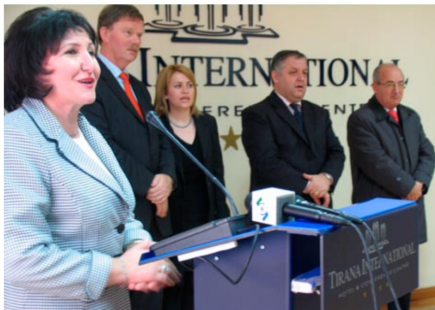
Photo: General Inspectorate of HIDAA, F. Laskaj, Head of OSCE Presence, R. Bosch and Deputy Minister of Interior F. Poni addressing local authorities after a training on conflict of interest prevention cases.

The European Union made available 950,000 Euros for a new project to support efforts in the fight against organised crime.