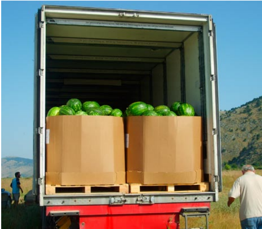
Photo: This summer USAID's EDEM program assisted watermelon farmers and consolidators export 362 tons of Albanian watermelons to Serbia, Greece, Germany and Croatia.