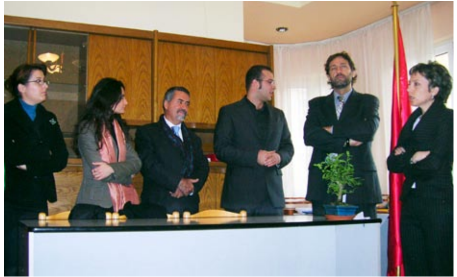
Photo: Representatives of the Italian Cooperation for Development and Tirana Municipality attend the inauguration of the Centre 'Primavera', run by the Italian NGO CICA and providing assistance to people affected by disabilities. (Photo: Italian Development Co-operation)

On 12 December 2007, the inauguration of the first class of the Albanian Centre for Restoration was held in Tirana in the presence of the Italian Deputy Ambassador, Francesco de Luigi and of the Director of the Department for Tourism and Works of Art of the Albanian Ministry of Culture, Iris Pojani. The opening was part of the project Capacity Building for Preservation and Restoration of Cultural Heritage of the Republic of Albania, implemented by UNESCO thanks to an Italian contribution amounting to 1.25 Million Euros. Classes, which include courses in restoration of mosaics, stucco-works, stone and wood, are attended by 20 students.