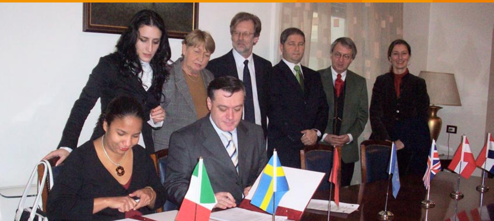
Photo: Minister of Finance Ridvan Bode and the World Bank Country Representative Camille Nuamah signing the Grant Agreement for the Multi Donor Trust Fund (MDTF)