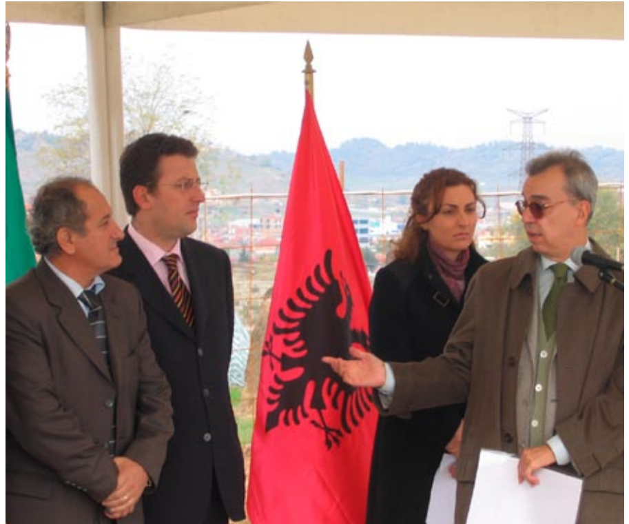
Photo: The Italian Ambassador, Saba d'Elia, and the Albanian Minister of Public Works, Transport and Telecommunications, Sokol Olldashi, inaugurate the opening of works to rehabilitate Sharra solid waste disposal. Italy provides 6 million Euros funding to widen and rehabilitate Sharra solid waste disposal. Works were inaugurated in November 2007.

On 16 November 2007, the inauguration of the works for rehabilitating Sharra Solid Waste Disposal took place, at the presence of Minister of Public Works, Transport and Telecommunications, Sokol Olldashi, the Minister of the Environment, Lufter Xhuveli and the Italian Ambassador, Saba d'Elia. A representative of the Municipality of Tirana - the project beneficiary - also attended the ceremony. The programme, amounting to 6 million Euros, aims at reducing the health and environmental risks related to non-appropriate management of the site, through the rehabilitation and widening of the disposal.