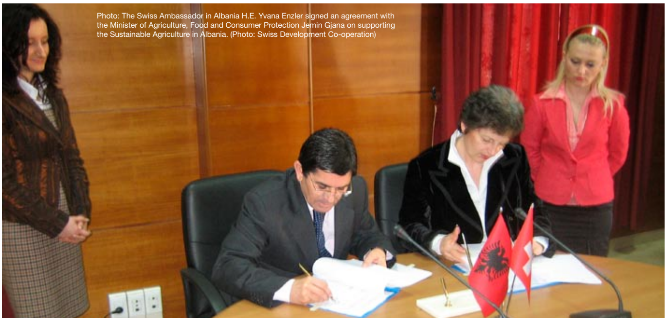
Photo: The Swiss Ambassador in Albania H.E. Yvana Enzler signed an agreement with the Minister of Agriculture, Food and Consumer Protection Jemin Gjana on supporting the Sustainable Agriculture in Albania.

on Water Supply and Environmental Lake Protection Shkodra, with a non-reimbursable contribution of around 6 million Euros in order to rehabilitate the water supply project in Shkodra. The aim is to improve the living conditions of the population and framework conditions for the local economy. Switzerland, the Austrian Development Corporation and German Credit Bank for Reconstruction KfW are co-funding to the value of 15.4 million Euros and 0.5 million Euros is supplied from the Albanian state budget.