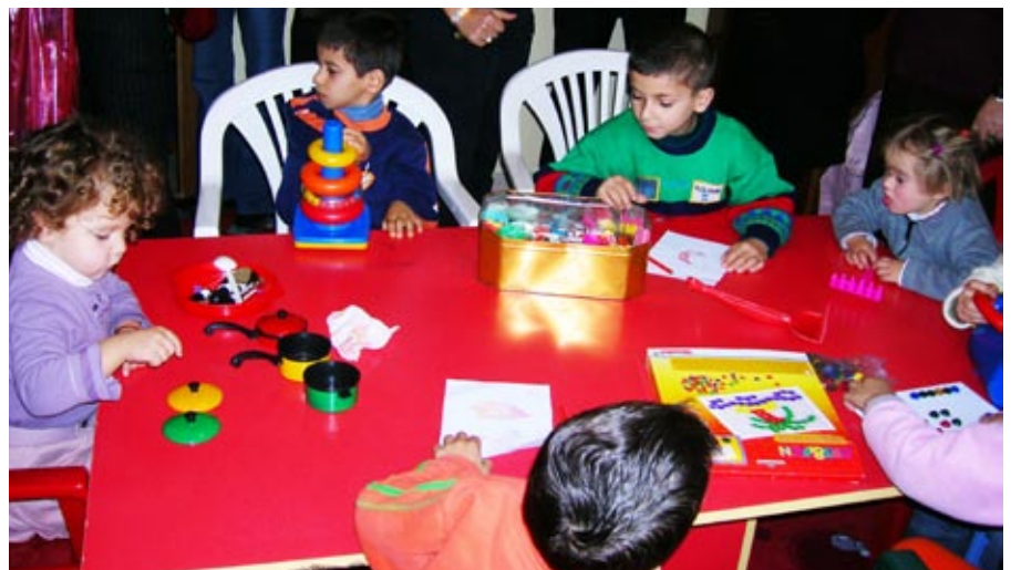
Photo: Italian contribution to CICA aims to foster the capacity and improve services provided by Tirana 'Primavera' Centre, assisting children and people affected by physical and mental disease.

implemented by the Italian NGO Comunità Internazionale di Capodarco (CICA). The initiative's aim is to provide assistance to children and people affected by mental or physical diseases, by fostering the quality of services provided in the Centre (physiotherapy, gym, speech therapy, family assistance and counselling). By the end of this 3-year project, the Centre will be equipped for providing daily assistance for up to 50 disabled children, as well as for taking care of further 450 disabled people outside the Centre. The Italy-funded Unit of Technical Assistance to the Ministry of Health has offered the required logistic and co-ordination assistance and the first meeting for starting this network was held in December 2007.