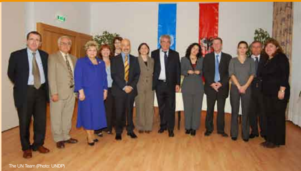
The UN Team

The DSDC has continued to work on the External Assistance Orientation Document. Some further consultation with Ministries has taken place to help to justify the orientation within sectors and the projects proposed for particular attention. The DSDC have been analysing past trends in external assistance, the priority needs identified by NSDI and the current programming directions of donors. This provides a basis for future orientation across sectors, both for external assistance and for the early stages of the budget cycle, which are about to start. Some informal discussions have taken place with donors and a working draft will be shared with key partners during the beginning of December.