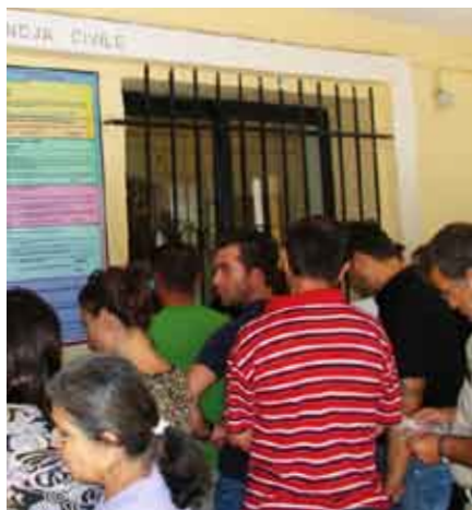
People in queue, waiting to receive identification documents at a civil service office in Tirana. The OSCE Presence in Albania is assisting the Albanian authorities computerise the fundamental registry books as well as establish address systems.

OSCE Presence organises a conference on the modernisation of the Address and Civil Registration Systems in Albania. On November 15, through its technical assistance project, the OSCE Presence in Albania held a conference on the modernisation of the Address and the Civil Registration Systems. The aim was to inform interested institutions on the ongoing and future developments regarding the address and civil registration systems, as foreseen in the project of the Ministry of Interior (MoI). The MoI is implementing the project with the Presence with funds from an EU technical assistance project and additional funding from the OSCE Presence and the US Government. Within the framework of the project of the MoI additional assistance is provided by Statistics Norway, funded by the Norwegian Government.