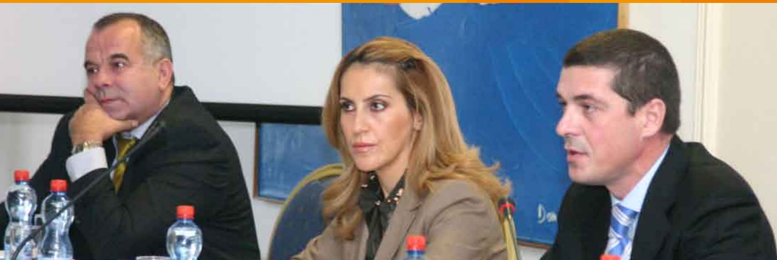
Minister of Integration Ms.M. Bregu and Deputy Prime Minister Mr. G. Oketa