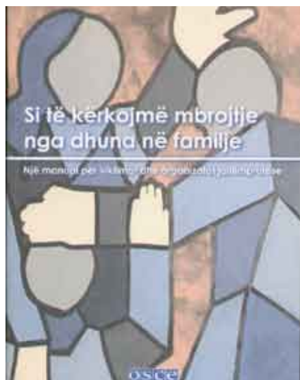
Handbook on Domestic Violence, published by the Presence, which provides information to victims and NGOs on how to deal with domestic violence issues.

will be made available to all OSCE participating States.